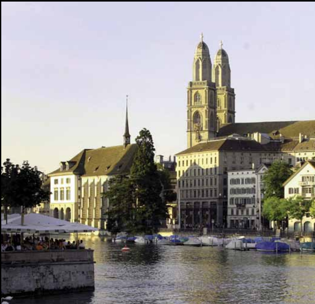
The Greater Zurich Region ranks first for economic potential of all the small regions in Europe