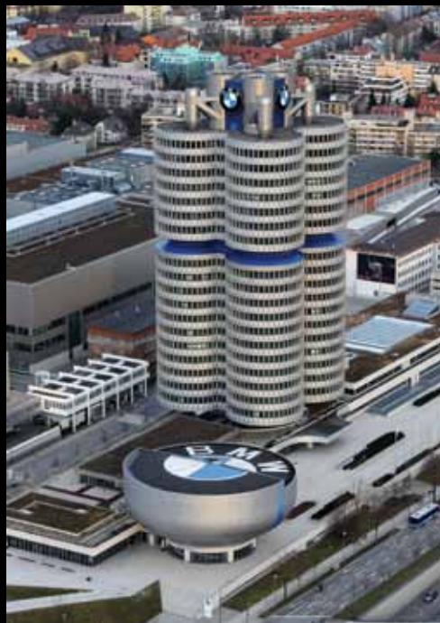
Driving growth: Munich is second in the western European city ranking