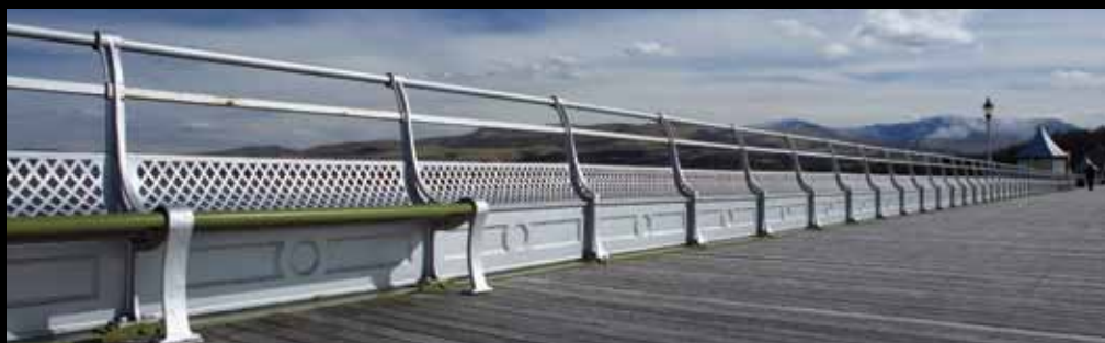
Bangor: number one micro-sized European city for human capital and lifestyle