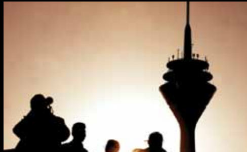
Fertile: Nordrhein-Westfalen, home to the city of Dusseldorf, tops the overall regions ranking for European Region of the Future 2014/2015

Note: List restricted due to shortage of suitable entries.