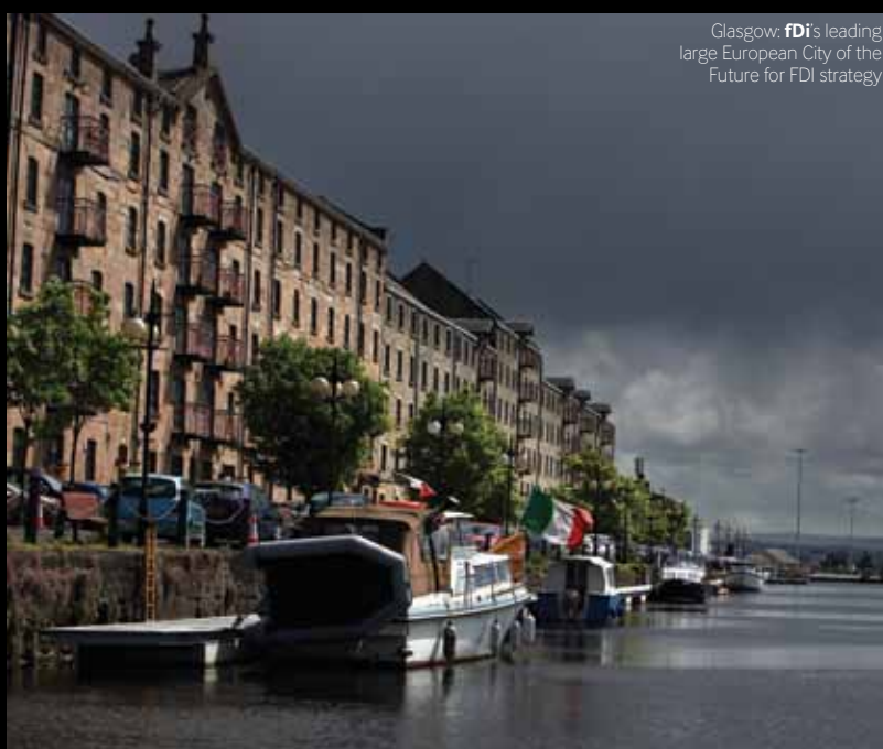
Glasgow: fDi's leading large European City of the Future for FDI strategy